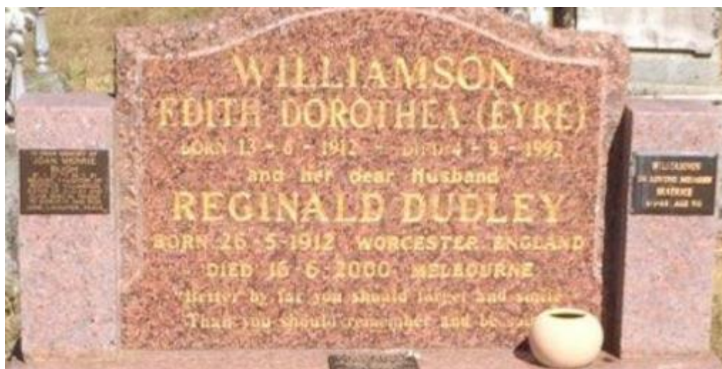
Arrow showing Beatrice Williamson's plaque – died 6 th January, 1983