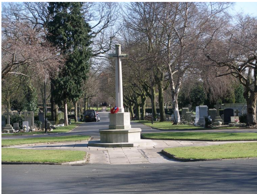
Yardley Cemetery, Birmingham

Yardley Cemetery, Birmingham contains 262 First World War burials, 62 of which form a war graves plot. Screen Walls commemorate those buried in the plot and in graves elsewhere in the cemetery not marked by headstones. Second World War burials number 250, 31 of them forming a small plot towards the centre of the cemetery, the rest scattered. The names of six men buried in graves not marked by headstones have been added to the existing Screen Wall. (Information & photos from CWGC)